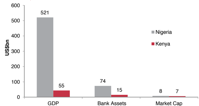
Graph 1 | Nigerian & Kenyan banks: contrasting numbers